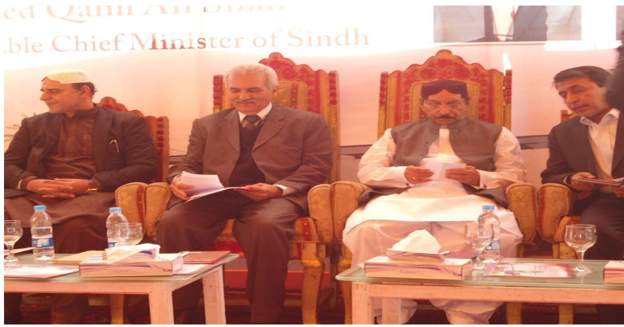
Sindh Chief Minister Syed Qaim Ali Shah and CEO NIP Mohsin Syed at the launching of Khairpur Special Economic Zone.

With the launching of KSEZ, NIP has introduced the concept of Rural Industrialization, a concept India and China have successfully adopted to curb migration of rural population to urban areas. Infrastructure work is in full swing at the site. Civil works of package 1, which include gate office, guard room, periphery fence has been completed. Plumbing and electrical works have also been completed whereas external works including carriageway and footpaths are nearing completion. This zone is appropriate for setting up date-processing and packaging plants, besides other agro-based industries. Khairpur is the city of dates, exporting different varieties of dates and fetching high price for the value added products.